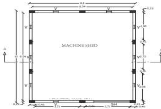
DOWN PLAN SCALE 1:100